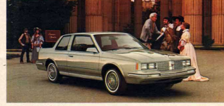
CUTLASS CIERA The best that is Cutlass...plus front-wheel drive.