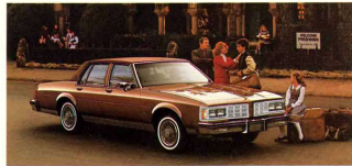
DELTA 88 The family car that didn't forget the family.

© Oldsmobile Division of General Motors Corporation