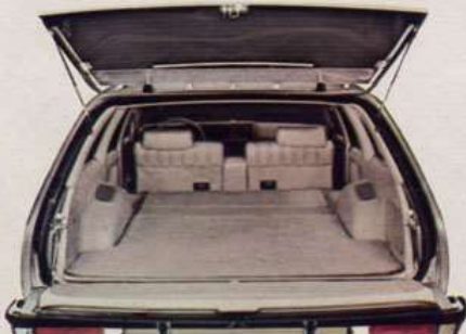
Easy does it! Convenient split tailgate and carpeted cargo area.