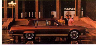
NINETY-EIGHT REGENCY The luxury car for logical people.