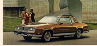
CUTLASS SUPREME An American favorite in style and value.