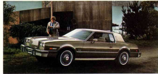
TORONADO One-of-a-kind car in a carbon-copy world.