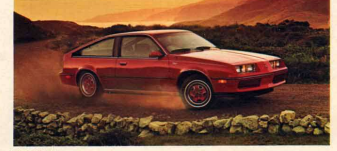
FIRENZA What a small car can be when it's an Oldsmobile.