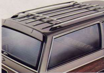
Room at the top! Available roof rack adds to the cargo space.