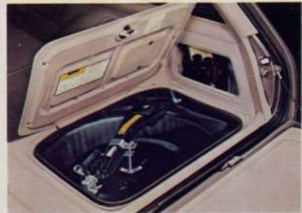
Out of sight! Hidden compartment/spare tire storage helps conceal and protect valuables.