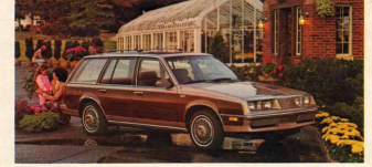
FIRENZA CRUISER Versatile new wagon joins the Firenza line.