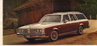
CUTLASS CRUISER First, it's an Oldsmobile. Then, it's a wagon.