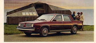
OMEGA Compact car practicality with solid Olds value.